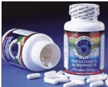
Ultimate Acidophilus Plus