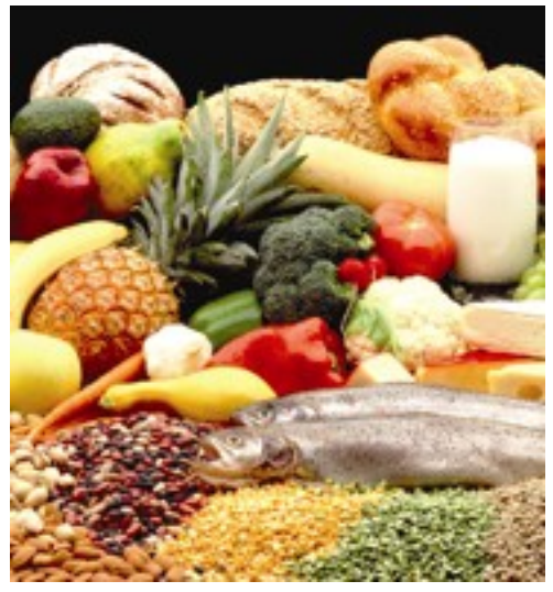
Organic foods are free of pesticide residue.

"Organics are better for the environment, and it's an investment in the revitalization of rural America," Scowcroft says. Organic farms are usually smaller, family-owned farms contributing to the economy of struggling rural America, he explains. The organic choice may be a little more expensive, but it's an investment in your health and the future.