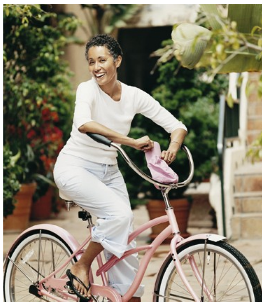
Free yourself from the often debilitating discomfort of fibromyalgia and take back your life.

Fibromyalgia is a soft tissue condition, and bodyworkers are experts at working with soft tissues. By including massage in your care, you can expect to manage and improve your fibromyalgia.